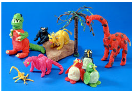
Creatures Made from Wikki Sticks

Apples to Apples Jr. -The Game of Funny Comparisons: This is the most fun fact game, I've seen in a long time. One person gets to be judge, while the rest of the players have to use their "best judgement" or match from the cards they are holding that "most completes" the card read aloud. Lots of laughter... and the judge always has the final say. Cost: $16.99 USD Publisher: http://www.otb-games.com/apples/apples_jun.html